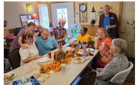
Everyone had a blast at a recent party at Carver House!