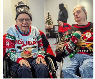
Folks from Lydia and English houses dressed in their ugly sweaters at the Holiday Party!